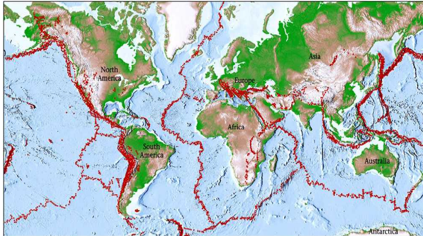
plate boundaries seismicity (earth quakes)